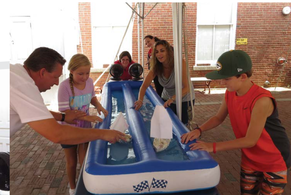
Visitors test their shipbuilding skills as they compete in Built to Win , a family-favorite program.

The goal of our gallery programs is to ensure that participants, of all ages, have fun while learning through STEM integration. We're not your average cabinet of curiosities, we are the USS Constitution Museum!