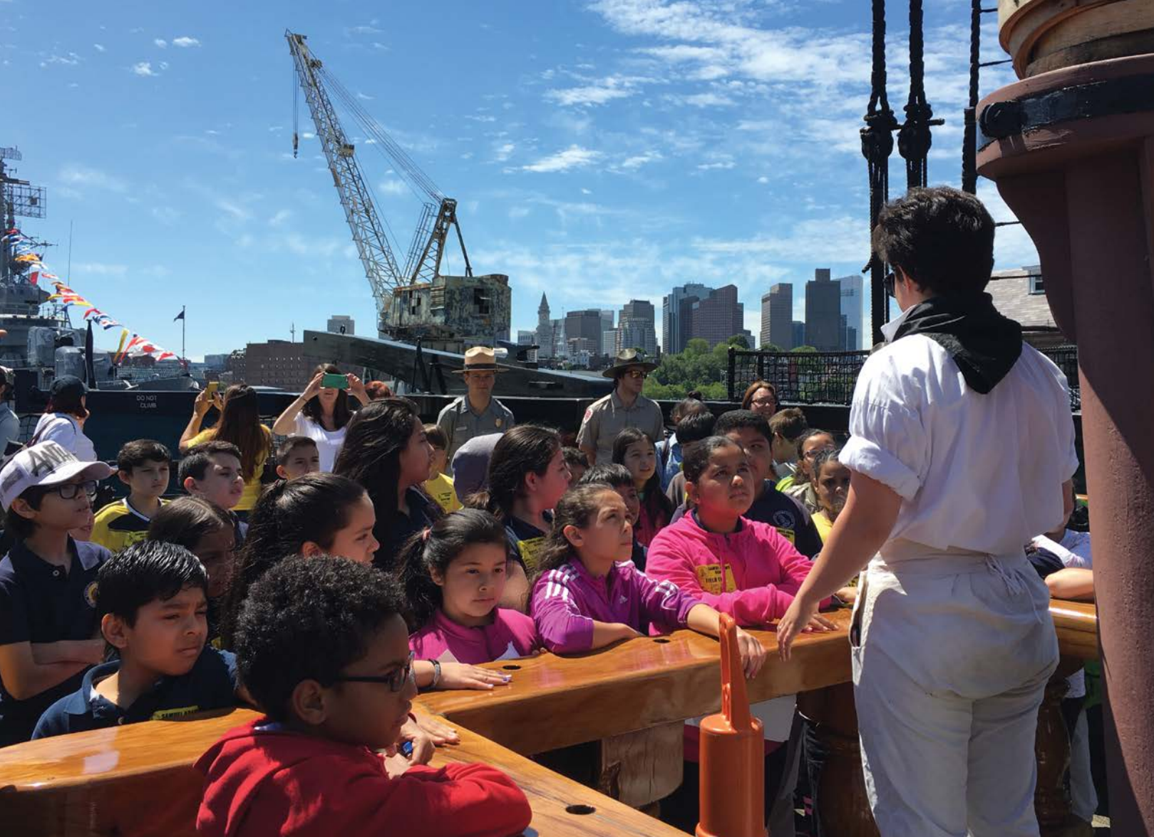
Fourth graders engage with a USS Constitution sailor during a field trip to "Old Ironsides" and the USS Constitution Museum.