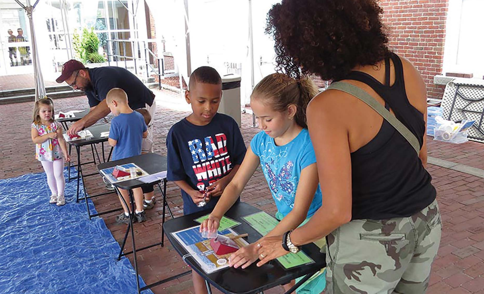
Families participate in STEM-based program Ready, Aim, Fire! in the USS Constitution Museum courtyard.