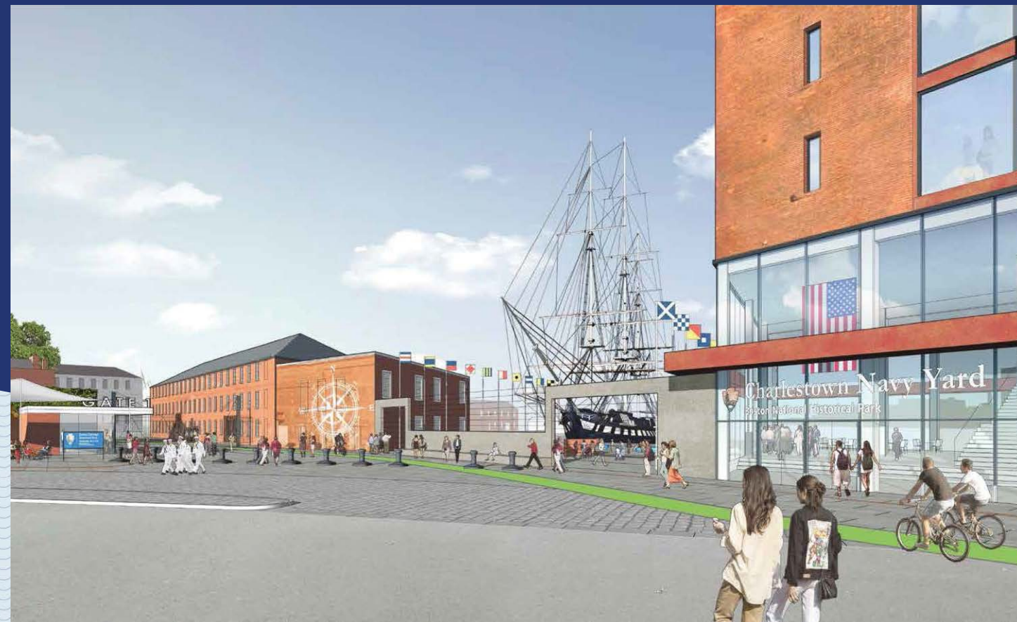
A conceptual rendering of the proposed welcome center located in the Hoosac Warehouse beside USS Constitution and Gate 1 of the Charlestown Navy Yard.

The National Park Service and USS Constitution Museum will experiment with messaging and visitor amenities throughout the Navy Yard, including signage, seating, and shaded areas. The Museum will focus on integrating signage with digital content to describe USS Constitution's long history in the Navy Yard. In the coming year the Charlestown Navy Yard Partners will continue to work together to design and plan for the future of this historic site.