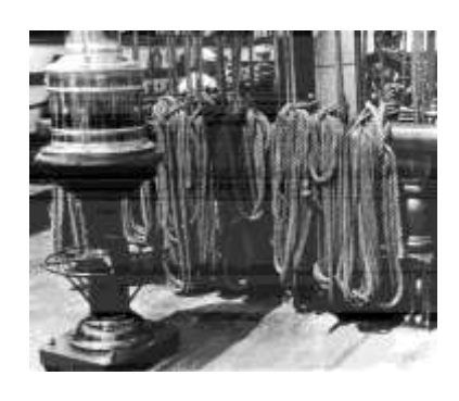
National Cruise, c.1931 – binnacle (c.1850-era) aft of Constitution 's mizzen mast; binnacle installed for cruise, it had with USS Constitution .

After the re-building of the ship in the 1927-31 restoration, several different binnacles were installed for the National Cruise.