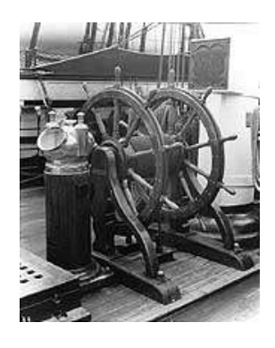
National Cruise, c. 1931 – binnacle (c. 1890-era) forward of wheel; binnacle installed for cruise, no other history it had no other history with USS Constitution ; today this binnacle is on loan to the USS Constitution Museum.