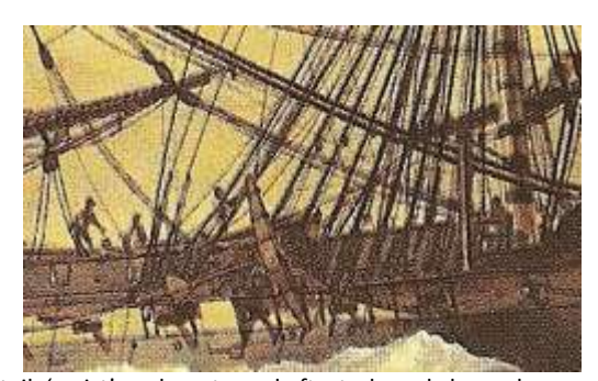
Detail, 'waist' anchor stowed aft, starboard channels, USS President Navy Art Collection