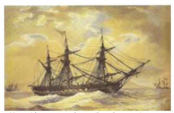
USS President , watercolor attributed to Antoine Roux, c. 1805. Navy Art Collection