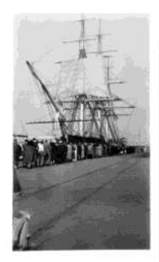
1931-34 USS Constitution traveled around the United States' 3 coasts on her<br/>"National Cruise"; although towed by the mine sweeper USS Grebe,<br/>Constitution was outfitted with a full suit of canvas sails and they were<br/>set during the cruise for pier-side demonstrations

Constitution with fore topsail set, San Francisco, February, 1933