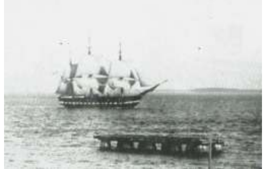
Only known photo of Constitution under sail, summer, 1881, Hampton Roads, VA

Fall, 1881USS Constitution sailed under her own power for the last time in her<br/>active career