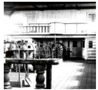
Spar deck, USS Constitution , showing double wheel, c. 1895

1927-31 USS Constitution was re-built (85% of the ship was "renewed," as stated by the