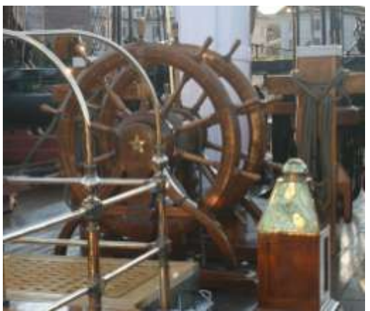
After spar deck, USS Constitution , July, 2011 NHHC Detachment Boston Photo

1931-1980s The double wheel made for USS Constitution 's 1927 restoration remained on board until the mid-to-late 1980s when it was removed and loaned to the USS Constitution Museum for exhibition. The wheel that is currently aboard the ship is the wheel that replaced the 1927 wheel (photo, above right).