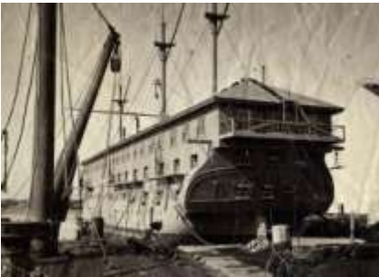
USS Constitution, Portsmouth Naval Shipyard, c. 1895