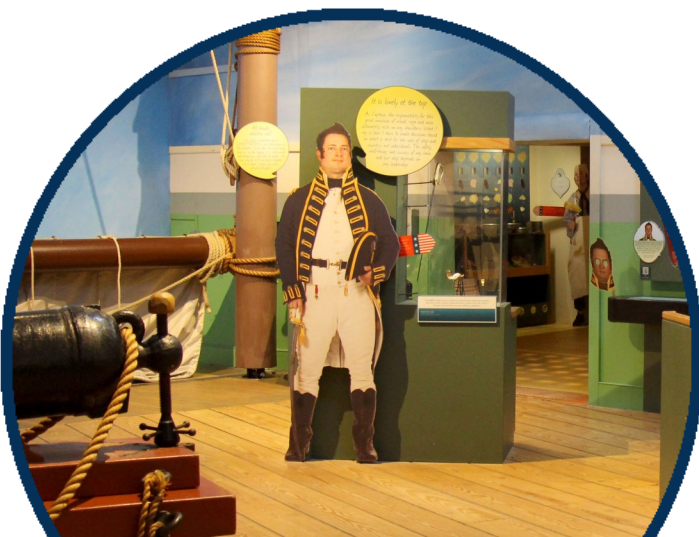
ALL HANDS ON DECK