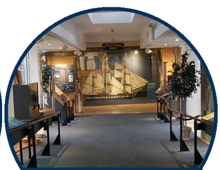
FOREST TO FRIGATE