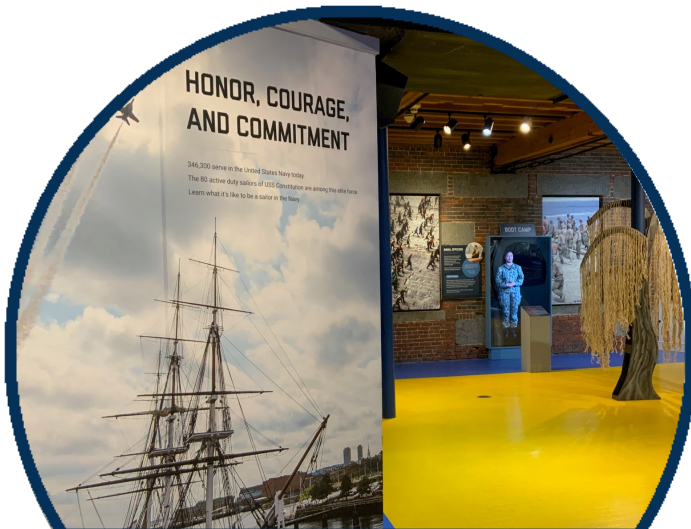
HONOR, COURAGE, AND COMMITMENT