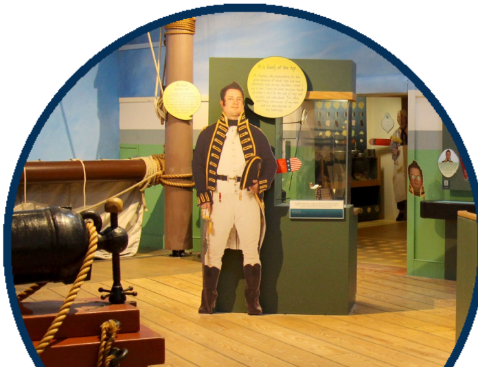
ALL HANDS ON DECK