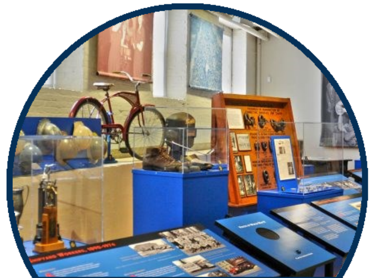
NPS VISITOR CENTER