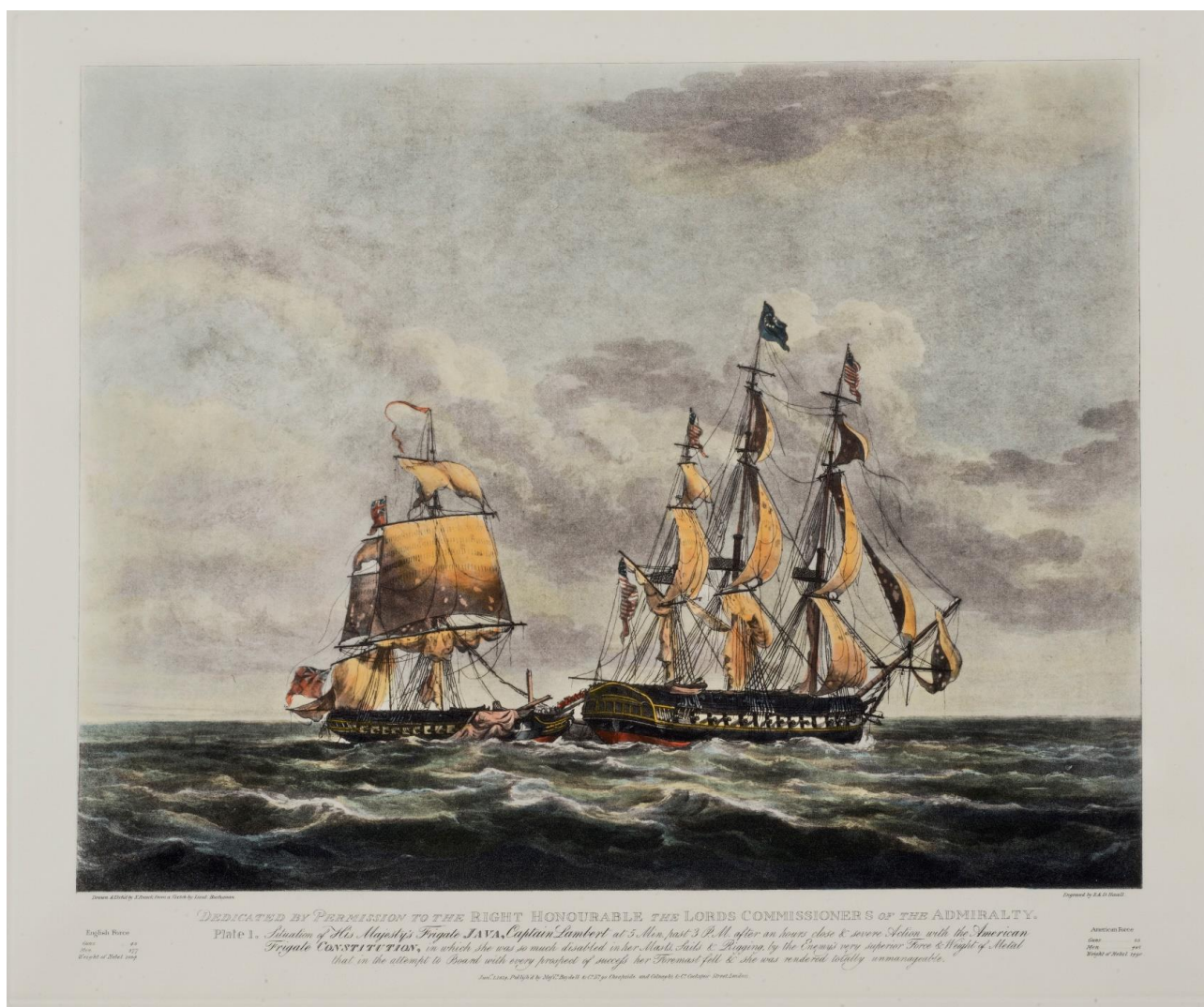
Constitution vs. Java , Plate 1 showing HMS Java with the foremast falling. First in a series of four hand-colored restrike prints made in the 20th century. The artwork is from a set of plates originally drawn and etched by artist Nicholas Pocock (1740 – 1821) in 1814, and engraved by Robert and Daniel Havell.