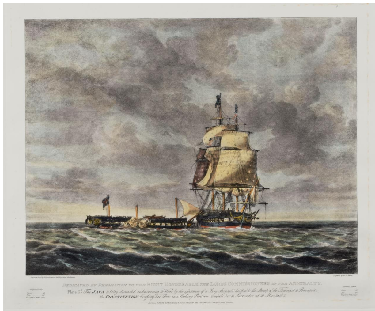
Constitution vs. Java , Plate 3 showing HMS Java without masts. Third in a series of four hand-colored restrike prints made in the 20th century. The artwork is from a set of plates originally drawn and etched by artist Nicholas Pocock (1740 – 1821) in 1814, and engraved by Robert and Daniel Havell.