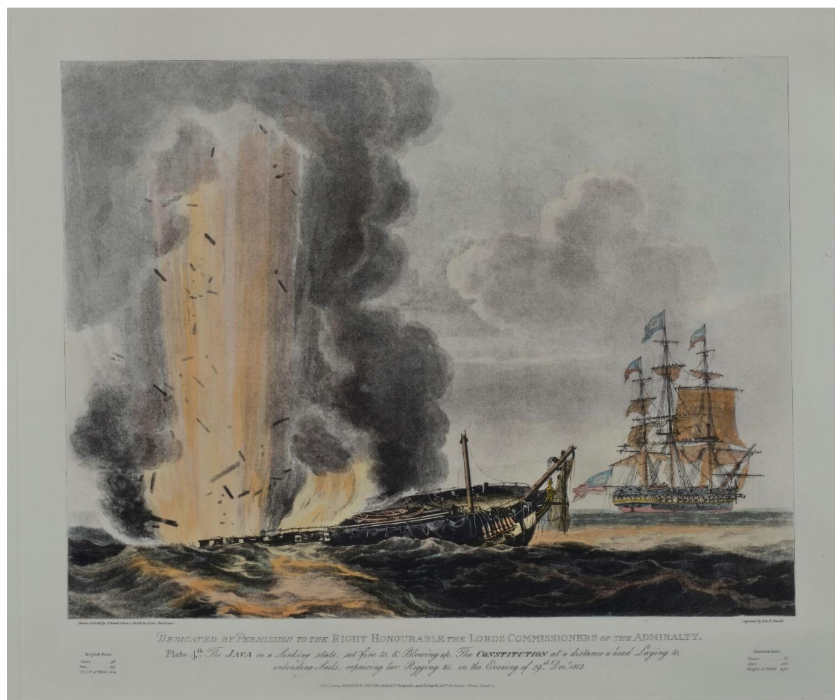
Constitution vs. Java , Plate 4 showing Java ignited in flames as the British crew are taken aboard USS Constitution . Fourth in a series of four hand-colored restrike prints made in the 20th century. The artwork is from a set of plates originally drawn and etched by artist Nicholas Pocock (1740 – 1821) in 1814, and engraved by Robert and Daniel Havell.