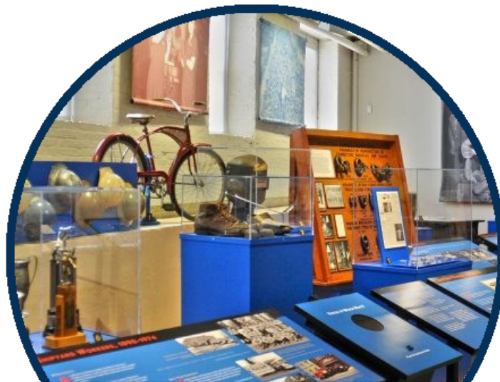
NPS VISITOR CENTER