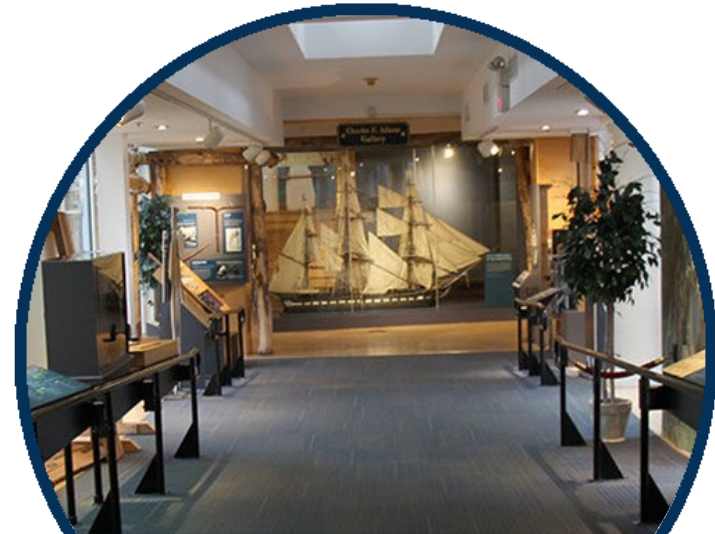
FOREST TO FRIGATE