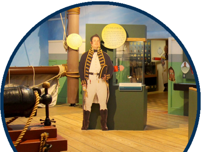
ALL HANDS ON DECK