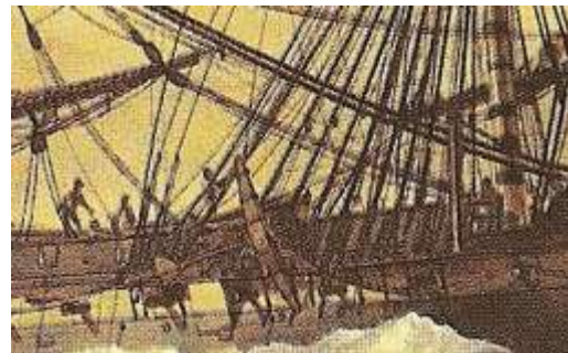
Detail, 'waist' anchor stowed aft, starboard channels, USS President Navy Art Collection

Naval History and Heritage Command Detachment Boston Up-dated, April, 2012