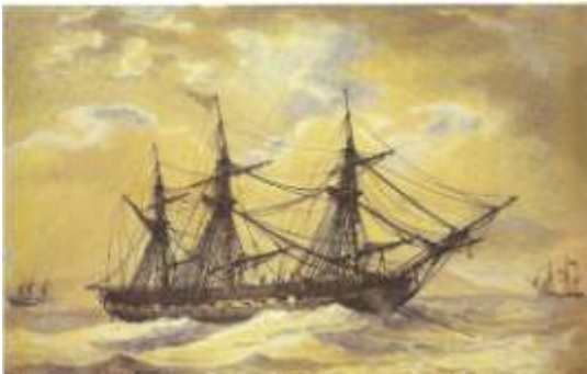
USS President , watercolor attributed to Antoine Roux, c. 1805. Navy Art Collection